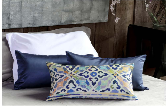
Above: Tiles III, Summer Sky Color Way Below Left: Tiles I