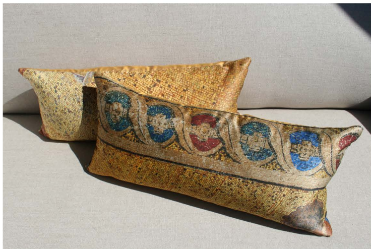
Above: Mosaics II & I Facing Page: Tiles V