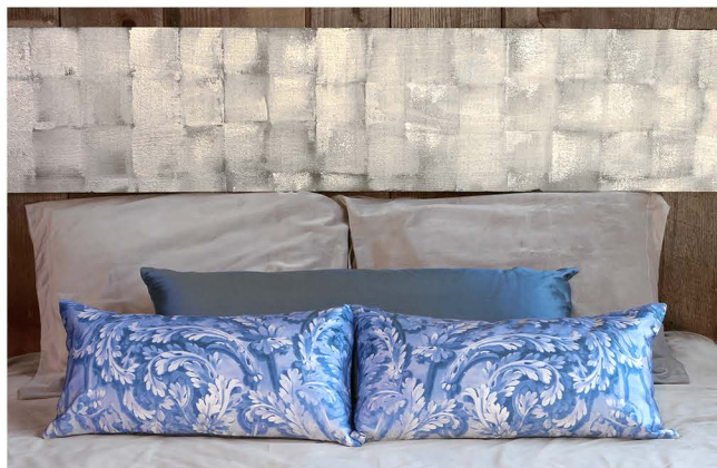
Fresco I, in pairs of gold or summer sky.