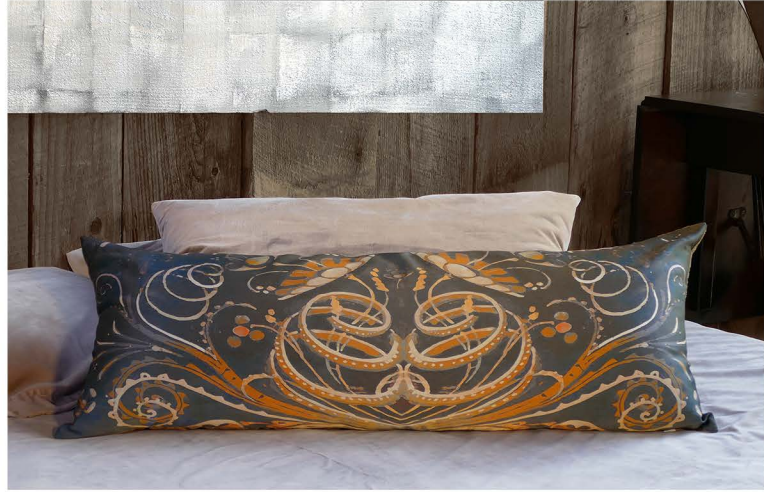
Above: Ode to Keats Facing Page: Patera in Marine & Brunello Color Ways