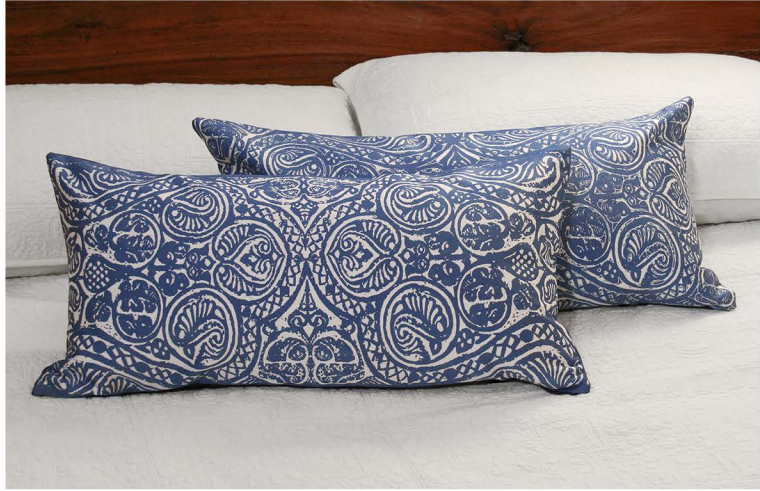
Above: Arabesque II & I in Indigo Facing Page: Arabesque I (front) Palazzo (rear) in Old Gold