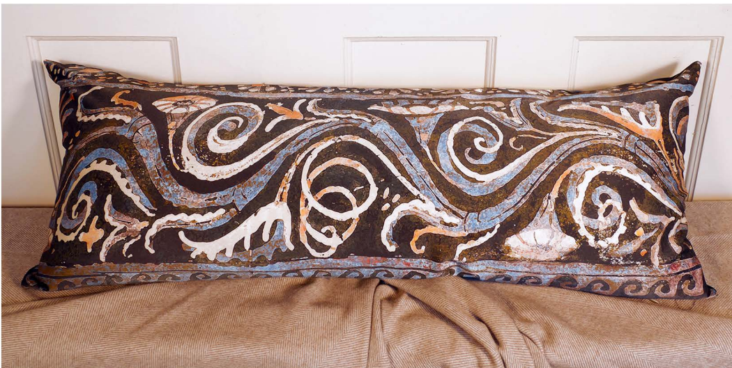
Patera - (K17009) 14"x x 36" • Silk