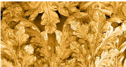
Acanthus I (AC14001) 12" x 24" • Silk