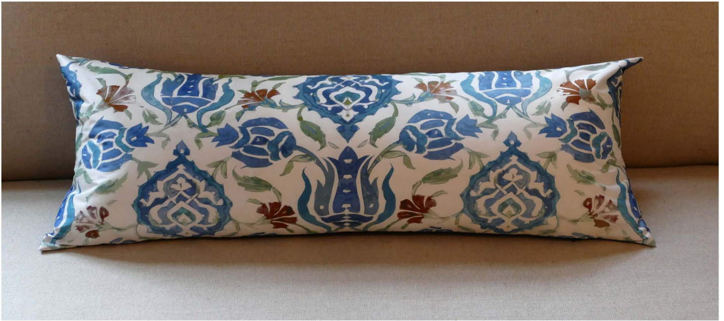
Tiles V 14" x 36" • Silk