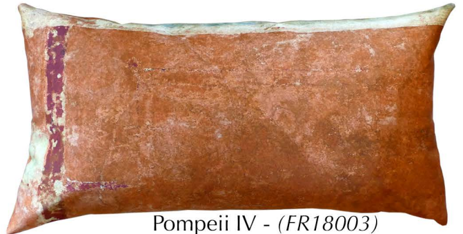
Pompeii IV - (FR18003) 12" x 24" • Silk