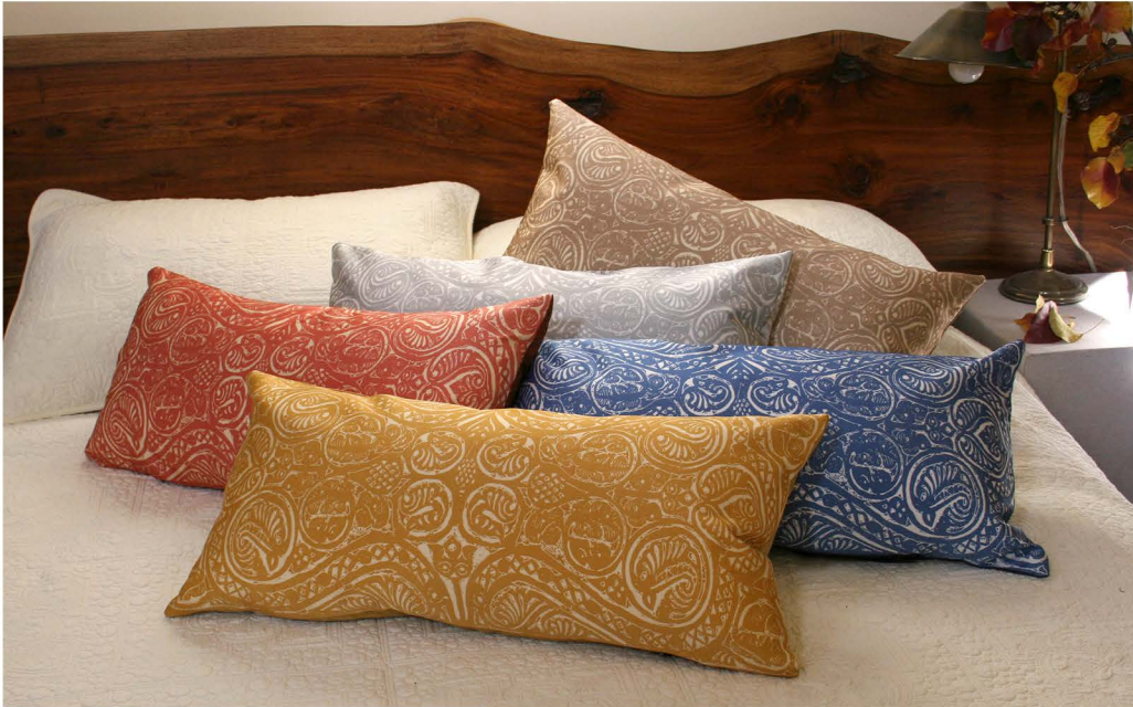
Arabesque I (BR16013) 12" x 24" • Silk

Sepia Linen - 01 Platinum- 02 Coral - 04b Indigo - 03 Gold - 05a