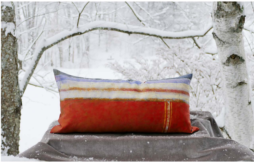
Pompeii I - (FR17010) 12" x 24" • Silk Ancient Red - 04 Old Gold - 05