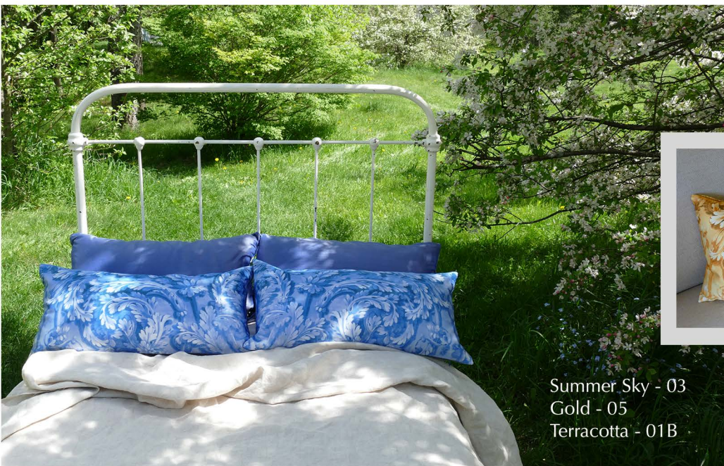
Fresco I (FR17001)

Pairs of "mirrored" design 12" x 24" • Silk