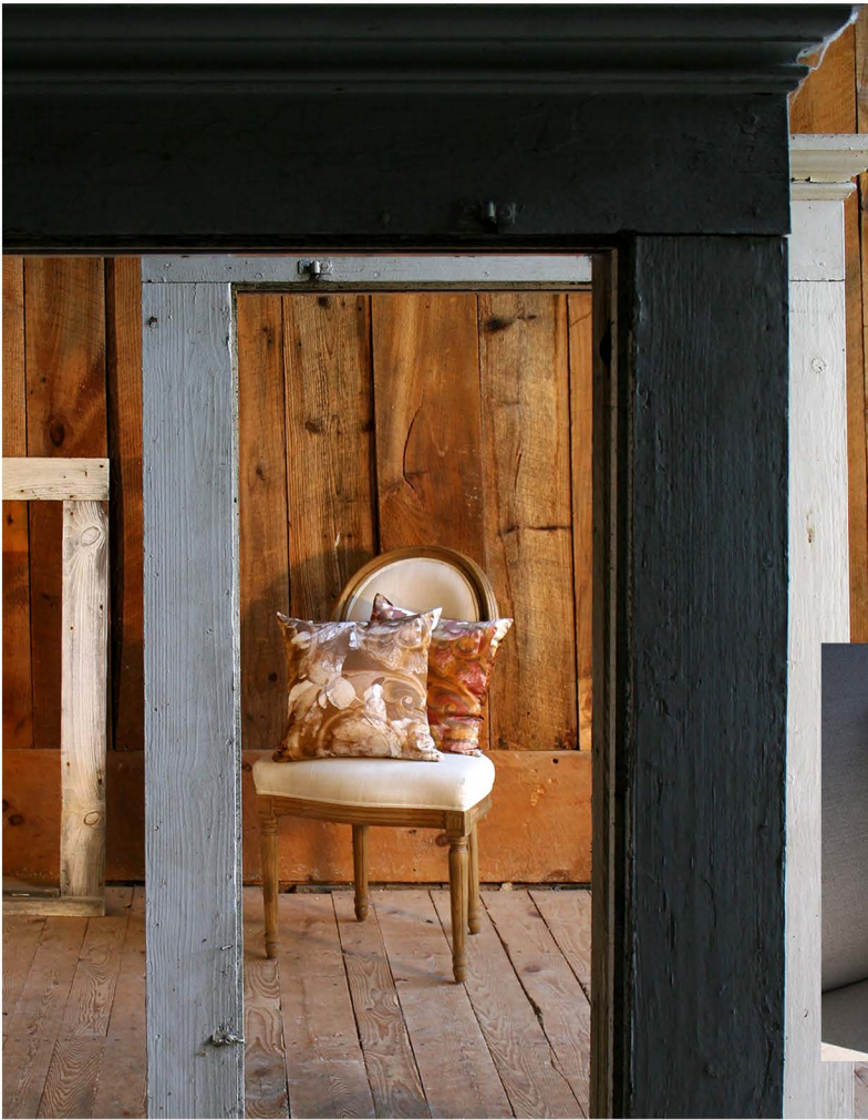
Acanthus Scroll (AC15006) 16.5" x 16.5" • Silk

Burgundy/Gold - 04cx Cocoa/Caramel - 01a