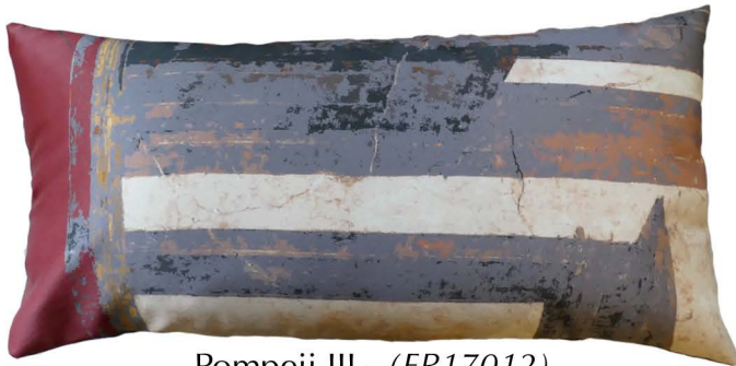
Pompeii III - (FR17012) 12" x 24" • Silk