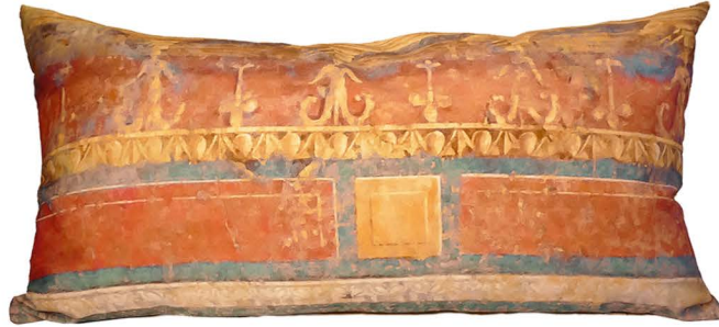
Pompeii II - (FR17011) 12" x 24" • Silk