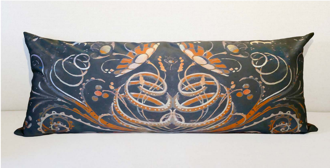
Ode to Keats- (K17020) 14"x x 36" • Silk