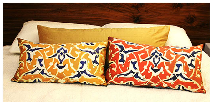
Tiles I 12" x 24" • Silk, Gold or Orange colorways