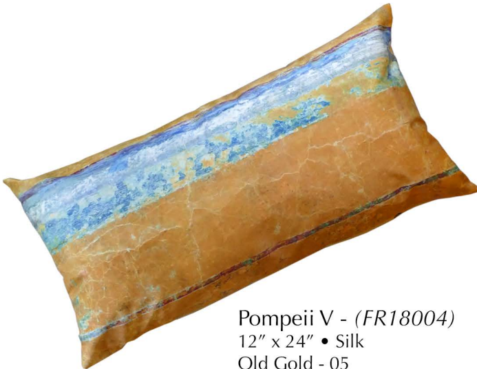
Pompeii V - (FR18004) 12" x 24" • Silk Old Gold - 05 Summer Sky - 03