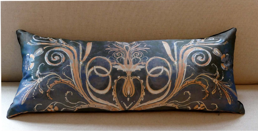
Krater - (K18001) 14"x x 36" • Silk