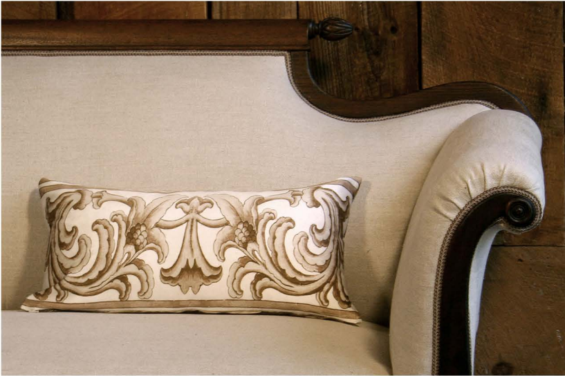
Anastasia Veronese (AN15003) 12" x 24" • Silk