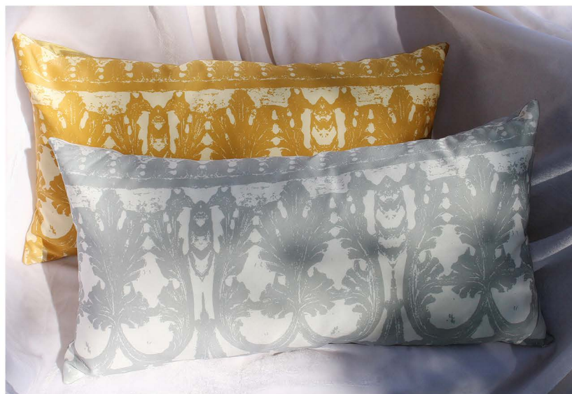
Palazzo (BR15002) 12" x 24" • Silk

Platinum - 02 Gold - 05a Summer Blue - 03 (not shown)