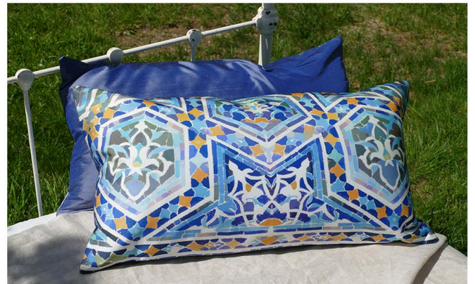
Tiles IV 12" x 24" • Silk