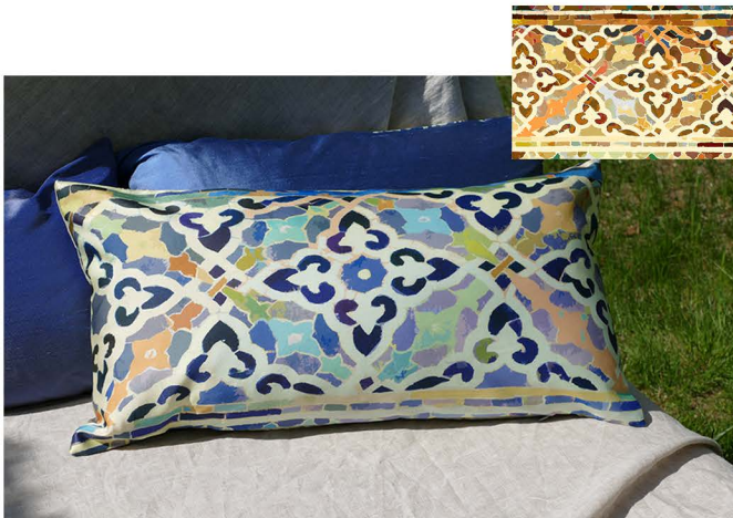
Tiles III 12" x 24" • Silk • Blue or Gold colorways