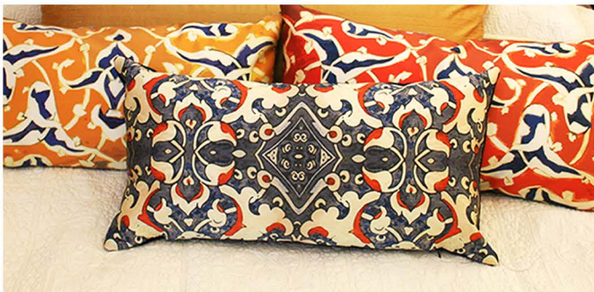
Tiles II 12" x 24" • Silk