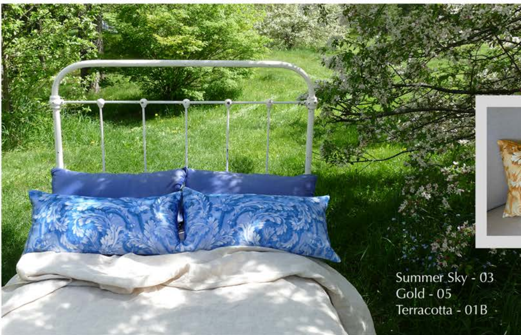
Fresco I (FR17001) Pairs of "mirrored" design 12" x 24" • Silk