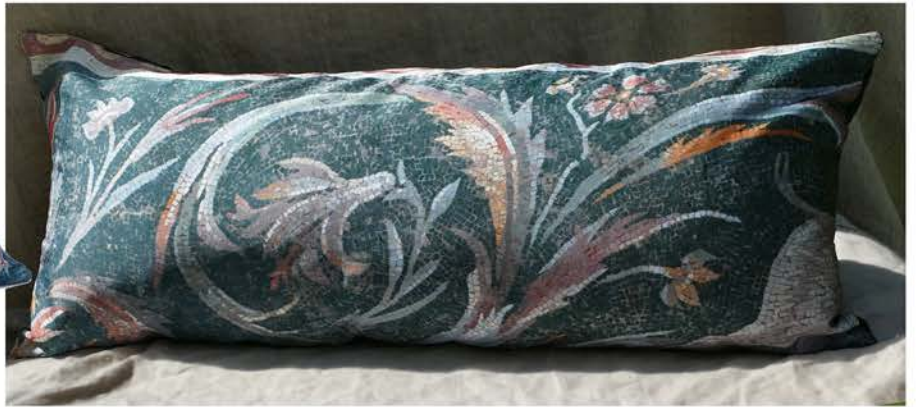
Mosaic VII - 14" x 36" Silk, teal background with mauve tones