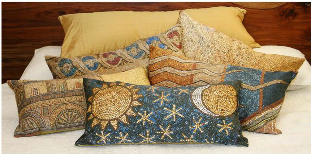
Mosaics I - V

12" x 24" • Silk Back Row L-R, II, I Middle Row L - R, V, III Front, IV