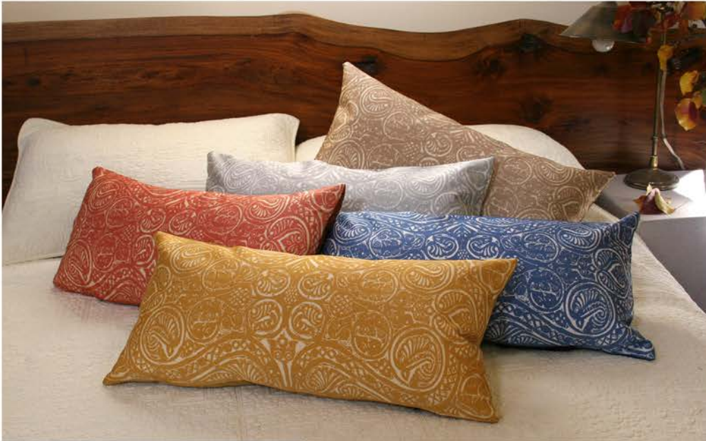
Arabesque I (BR16013) 12" x 24" • Silk