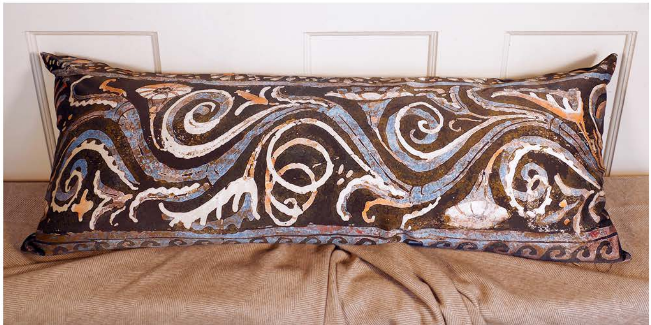
Patera - (FR17009) 14" x 36" • Silk