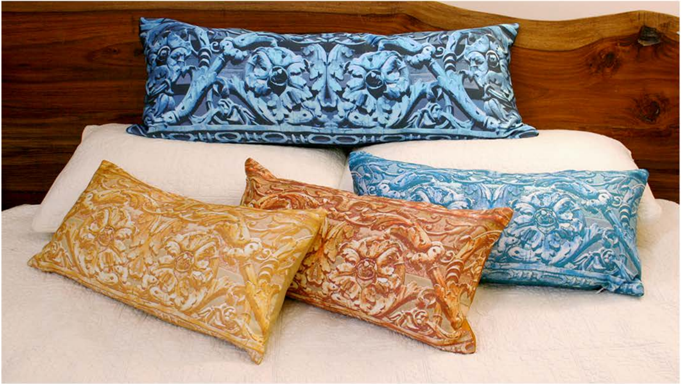
Forge I (FO16002) 12" x 24" • Silk Gold - 05a Pumpkin Spice - 05b Ocean- 03b Sepia Linen - 01 (not shown)