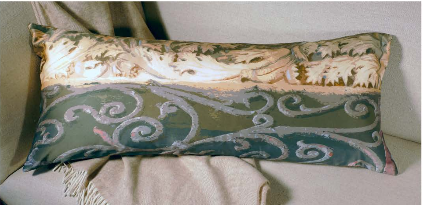
Ironstone (FO15006) 14" x 36" • Silk