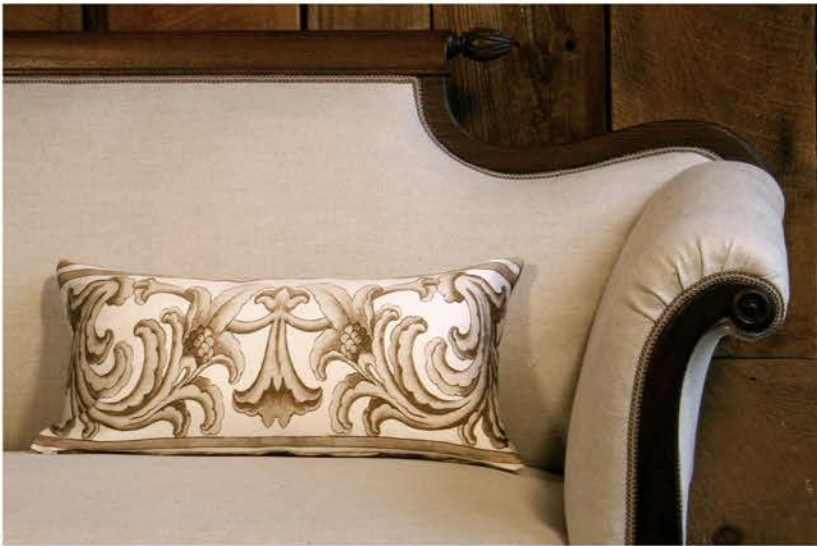
Anastasia Veronese (AN15003) 12" x 24" • Silk