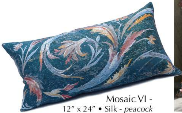
Mosaic VI - 12" x 24" • Silk - peacock