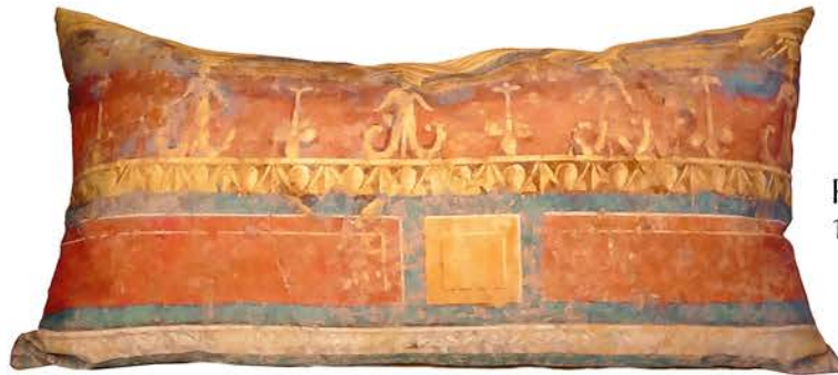
Pompeii II - (FR17011) 12" x 24" • Silk