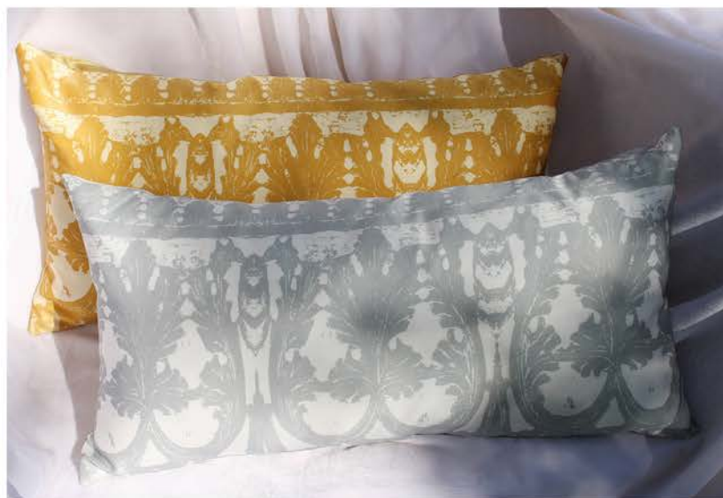
Palazzo (BR15002) 12" x 24" • Silk